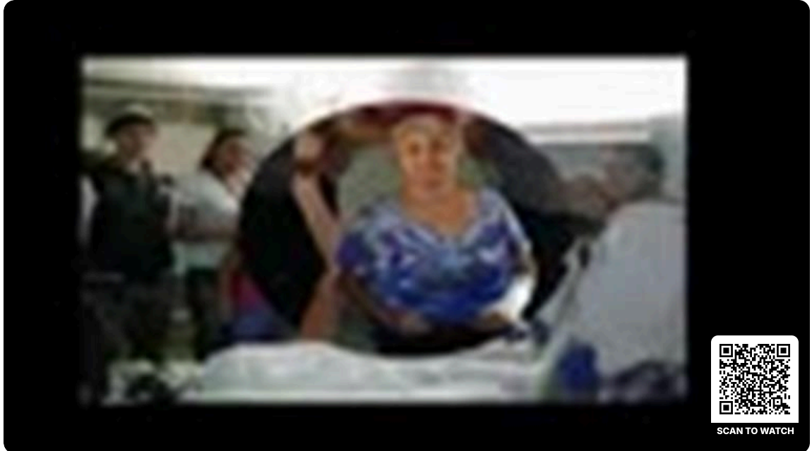
Forever the Queen of my heart